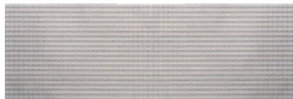
Cube Classic 16"x 48"