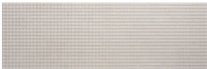
Cube Mist 16"x 48"