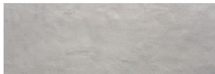
Argent Classic 16"x 48"