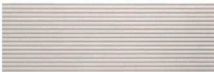
Line Mist 16"x 48"

Matte Finish Wall Tile White Body Porcelain Tile